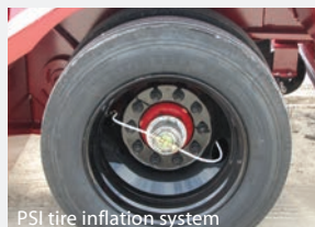
PSI tire inflation system