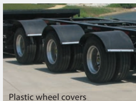
Plastic wheel covers