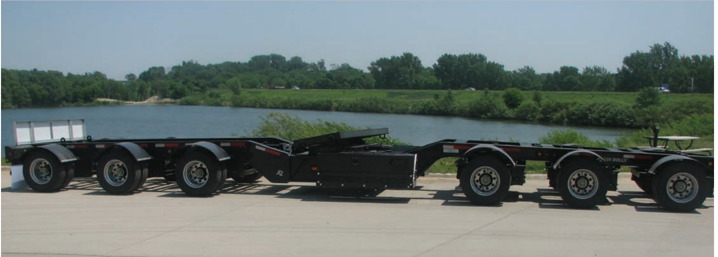
XL 6 Axle Dolly